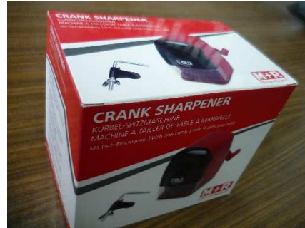
Crank sharpener in 1er box